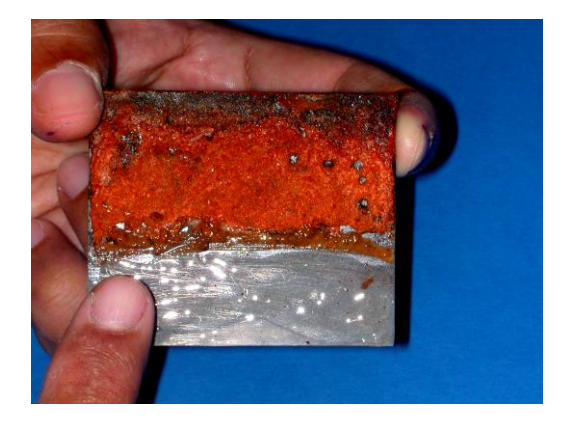
Treated with VAPPRO 810G