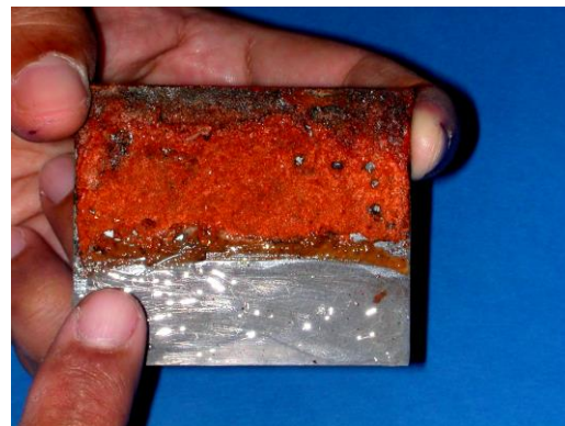
Treated with VAPPRO 811G