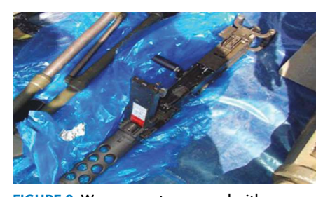
FIGURE 3 Weapon parts wrapped with transparent plastic sheets containing a VCI.

solar radiation, and salt-laden atmosphere as well as saline, brackish, and briny water, create a harsh corrosive environment. The military vehicles are damaged by corrosion, erosion, abrasion, and wear that impair vehicle mobility and long service life, requiring costly, ongoing maintenance. Plastics, elastomers, and composites are generally unsuitable alternatives because they deteriorate by physicochemical mechanisms.