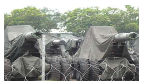
FIGURE 1 Heavy cannons on wheels covered with rough canvas fabric impregnated with a VCI.

The most commonly used vehicle is the high mobility multipurpose wheeled vehicle, also known as the Humvee, particularly in the deserts of the Middle East. The complex interaction of chemical and climatic factors, such as hot afternoons and cold nights, with dew condensation, intense