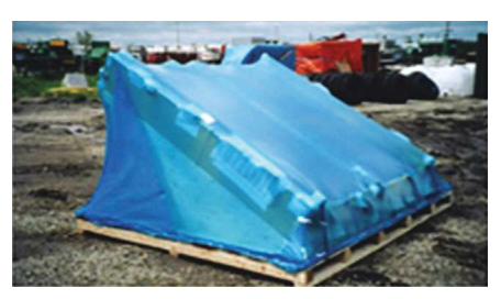
FIGURE 2 Wrapped military hardware on a wood pallet ready for moving.