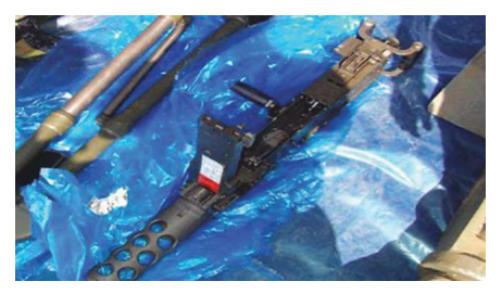
FIGURE 3 Weapon parts wrapped with transparent plastic sheets containing a VCI.

solar radiation, and salt-laden atmosphere as well as saline, brackish, and briny water, create a harsh corrosive environment. The military vehicles are damaged by corrosion, erosion, abrasion, and wear that impair vehicle mobility and long service life, requiring costly, ongoing maintenance. Plastics, elastomers, and composites are generally unsuitable alternatives because they deteriorate by physicochemical mechanisms.