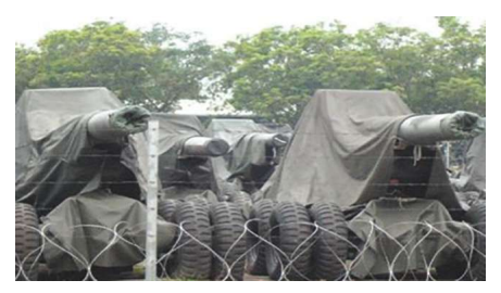
FIGURE 1 Heavy cannons on wheels covered with rough canvas fabric impregnated with a VCI.

The most commonly used vehicle is the high mobility multipurpose wheeled vehicle, also known as the Humvee, particularly in the deserts of the Middle East. The complex interaction of chemical and climatic factors, such as hot afternoons and cold nights, with dew condensation, intense