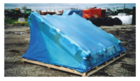
FIGURE 2 Wrapped military hardware on a wood pallet ready for moving.